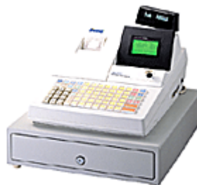
ER-650, ER-650R and ER-655II