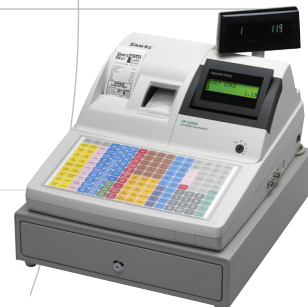
ER-5200M, ER-5215M and ER-5240M